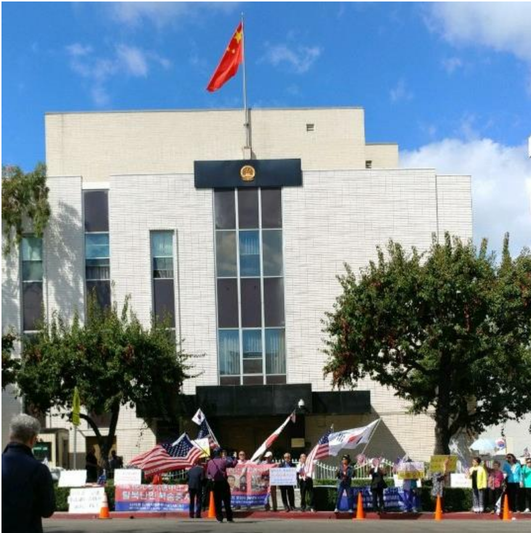
Activists in Los Angeles demonstrate at the PRC Consulate.

The Los Angeles activists also posted their event on youtube and facebook at these links: