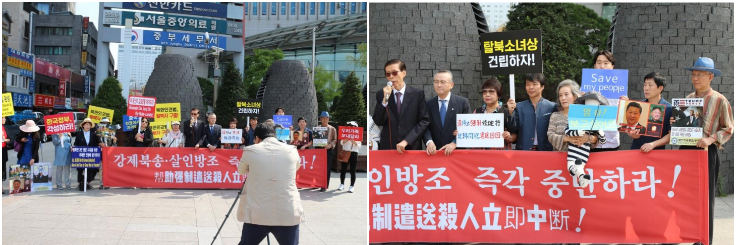
Activists in Seoul stage demonstration against China’s repatriation policy.