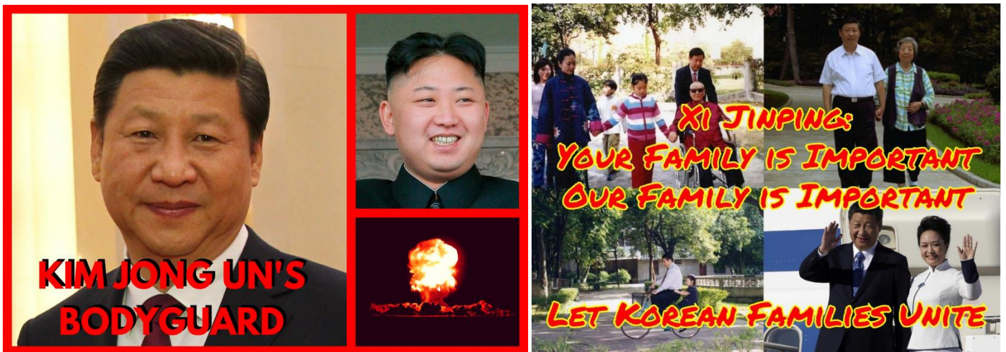
Posters used at the Save North Korean Refugees Day demonstrations.