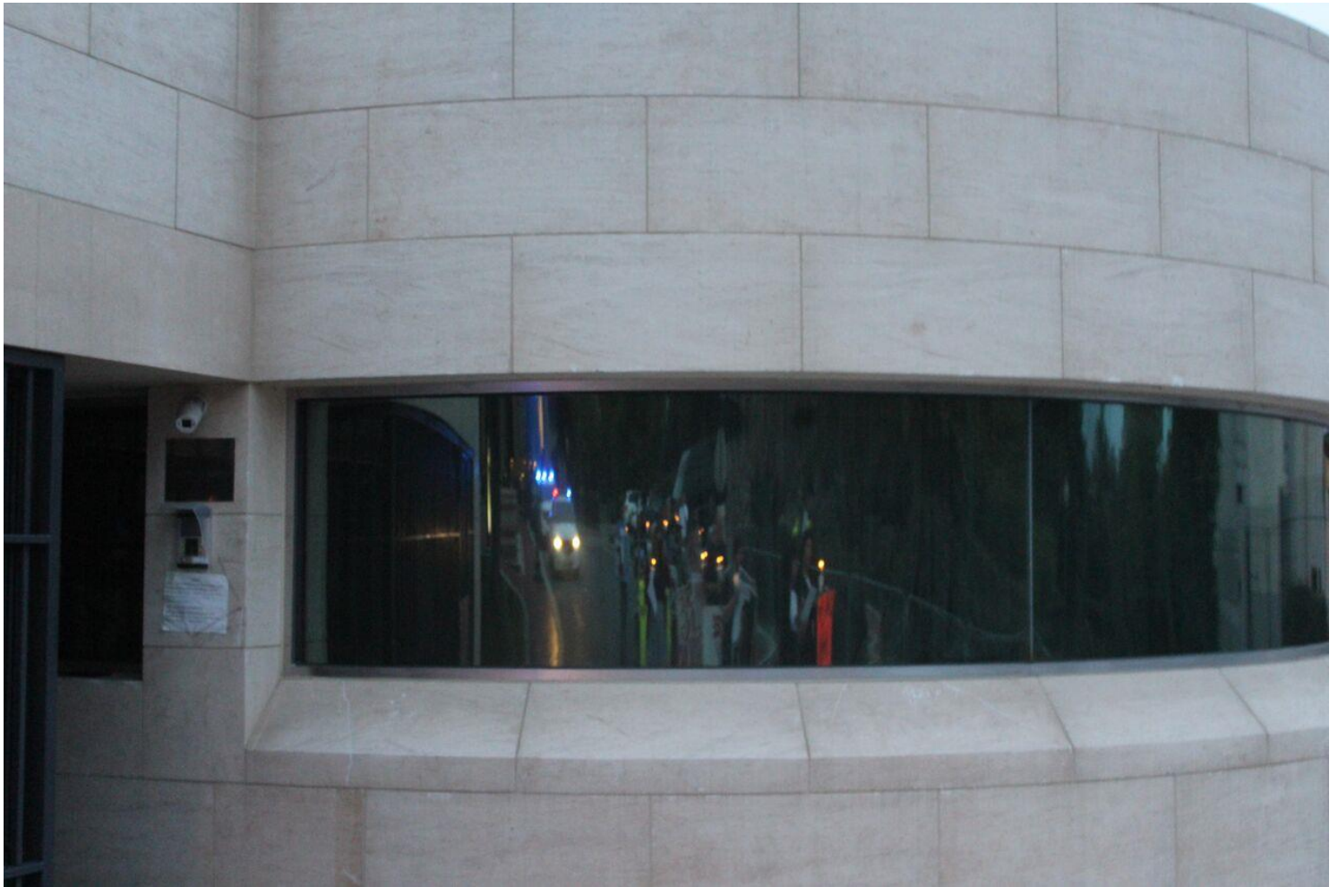
PRC Embassy windows reflect the candles from the vigil in Washington, DC.

Kim regime. We are asking God for the dismantlement of the DMZ and the reunification of a free Korea without military intervention.”